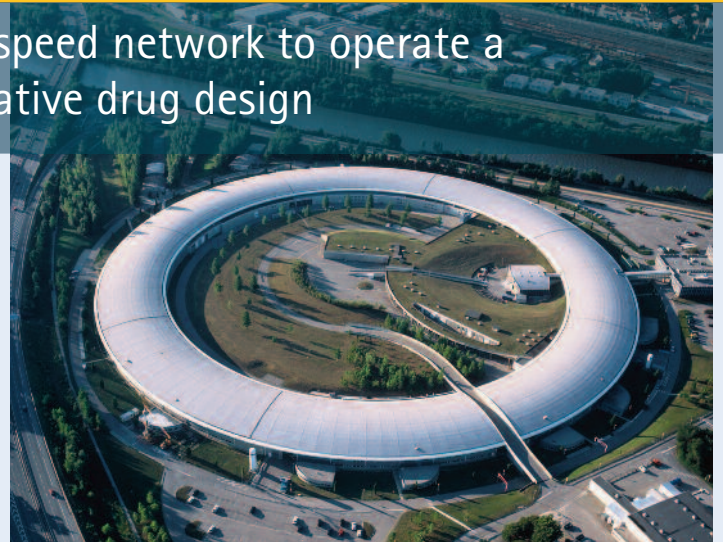
ESRF synchrotron facility, Grenoble, France

In a series of international collaborative experiments, scientists at the Homi Bhabha National Institute, India (HBNI) relied on TEIN3's fast internet access to connect remotely to the third generation European Synchrotron Radiation Facility (ESRF) in Grenoble, France using the collected high-quality protein crystallographic data for the design of new drugs.