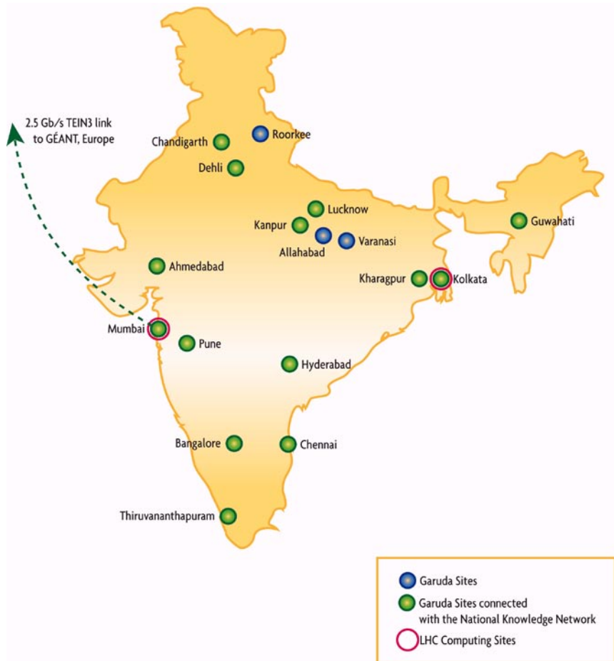
Fig. 1. Map of GARUDA and LCG sites

In India, two main Grid Initiatives have been taken at Government level: Regional WLCG set up by the Department of Atomic Energy (DAE) in coordination with the Department of Science & Technology (DST) and GARUDA National Grid Initiative. Both of them established a fruitful collaboration with the EU-IndiaGrid project and its successor EU-IndiaGrid2.